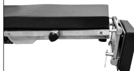
Head Plate Down 0°-90°