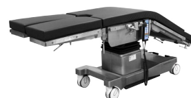
Back Plate Down 0°-20°