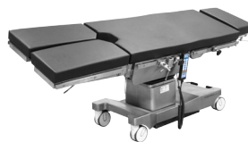
Lateral Tilt Left 0°-15°