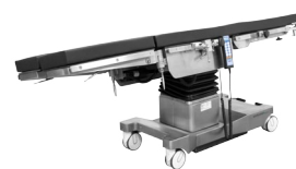
Lateral Tilt Right 0°-15°