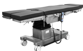
Horizontal Sliding 350mm