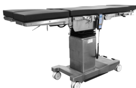
Highest Position of Table Top 1010mm