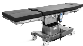
Lowest Position of Table Top 710mm