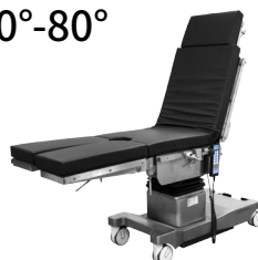
Back Plate Up 0°-80°