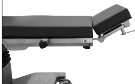
Head Plate Up 0°-40°